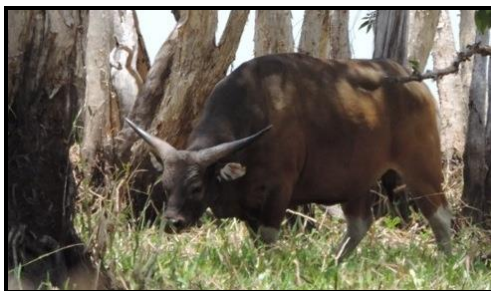
Young Banteng Bull (approx 450kg)